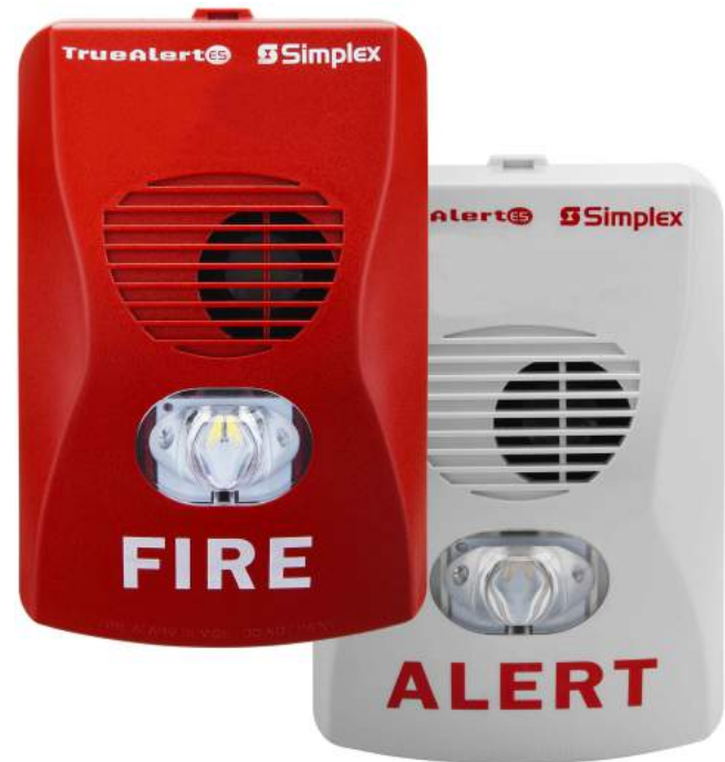
Figure 1: TrueAlert ES 59AV LED Addressable A/Vs are Available in Red with White Lettering and White with Red Lettering